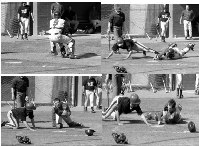
FIGURE 3. The "Bang-Bang" Play

The play shown in Figure 3 is an excellent example of good baseball gone, unfortunately, "bad" with reference to the No Collision Rule. That is, this is one of those "marginal" cases that require some thought on the part of the umpire.