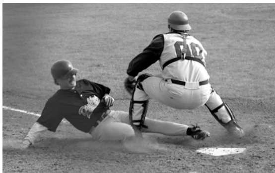
FIGURE 4: The way the game should be played

game itself. But then, safety should take a priority, and anything the umpire can do to ensure this, the better off everybody becomes. In either case, a tough decision.