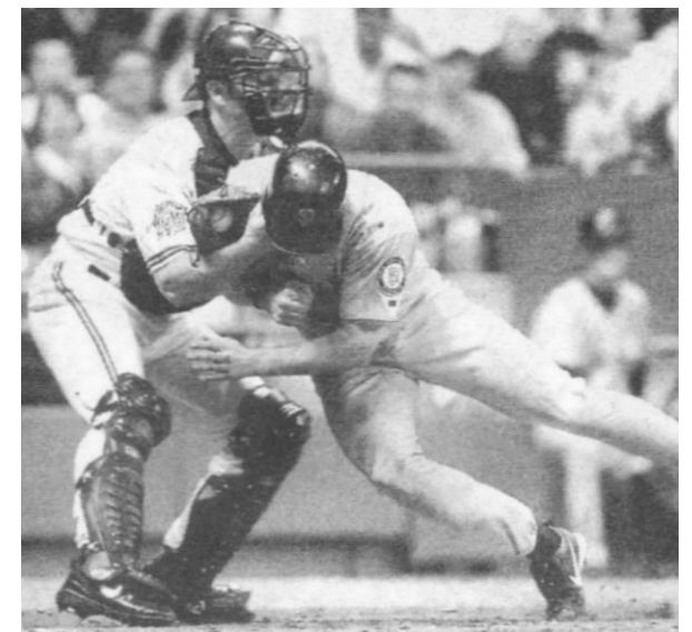
FIGURE 1. Possession

Not a whole lot of interpretation involved with Figure 1 . The catcher clearly is in full possession of the ball and the runner's intent is pretty obvious. Although this is "good, hard professional baseball," it is definitely a violation of the NWIBL No Collision Rule. If you ever witness this play, and regardless of whether the catcher (or any defensive player) was able to hold onto the ball, the runner should be called out and, in this case, ejected from the ball game. A "no-brainer" for any umpire. Note: Even though this photo is obviously from a professional game, it serves as a good example of what a runner can't do in a NWIBL Game.