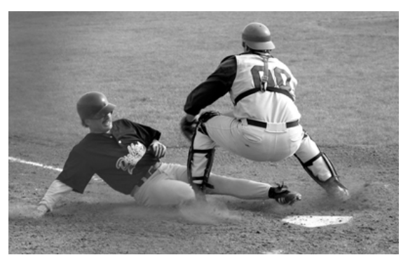
FIGURE 4: The way the game should be played