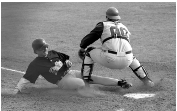
FIGURE 4: The way the game should be played

The catcher has possession of the ball (located in heal of glove) and tagging out an unknown runner. T rear portion of the plate was give to the runner Good baseball on the part of both players. (Of course, the real question is this: Did he make the tag before the runner's foot touched the plate? Ooh, baby---close play, tough call!)